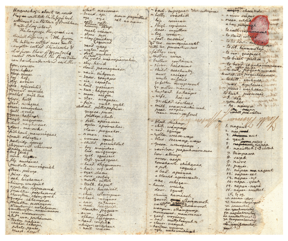
FIGURE 1. Language documentation notes from Thomas Jefferson's "Vocabulary of the Unquachog Indians," 1791. American Philosophical Society.

to start working out the relationships between Sanskrit and languages of India and Iran and their European relatives.